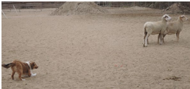
Shiloh, pictured at four months, learned a new position from a Border Collie who is in the arena with him.

It would take several months for Shiloh to develop enough self-confidence to work sheep on his own. Techniques we would use to develop Shiloh's confidence included placing him on top of a sheep so he could feel dominance over the sheep, having Ben in the ring first then letting Shiloh in to help Ben. The difference here is if we put Shiloh in first then Ben, Shiloh would feel he needed help and Ben was coming it to take over.