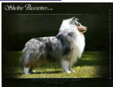
(The above are some examples of our newly-reduced magazines.)

Email me (before April 8th) a list of those back issues you're purchasing, and we'll bring them to you at the St. Louis National Specialty—thus saving you the p8h costs!